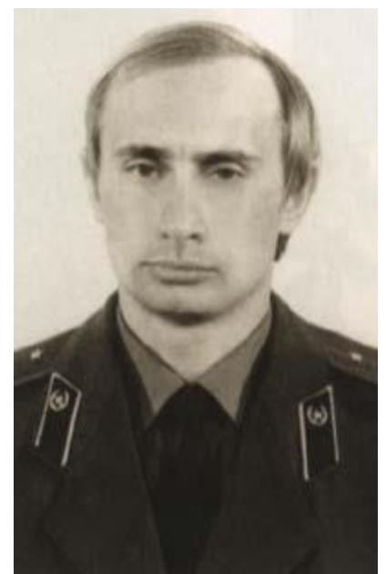
Putin in KGB uniform