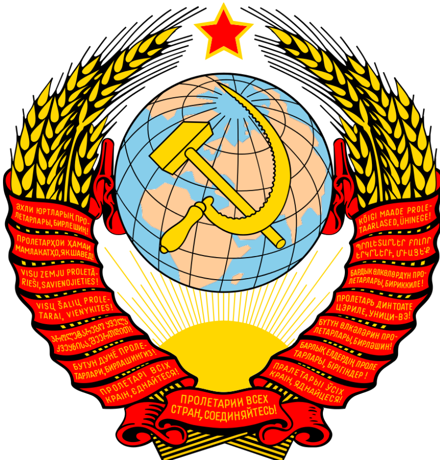
Seal of the Soviet Union (USSR)