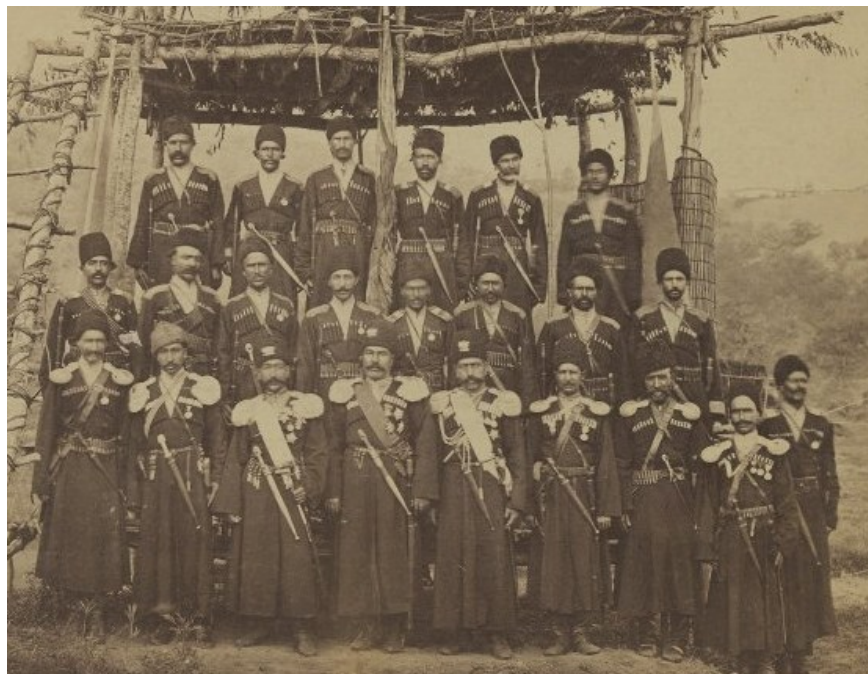
Persian Cossacks, some time after 1876