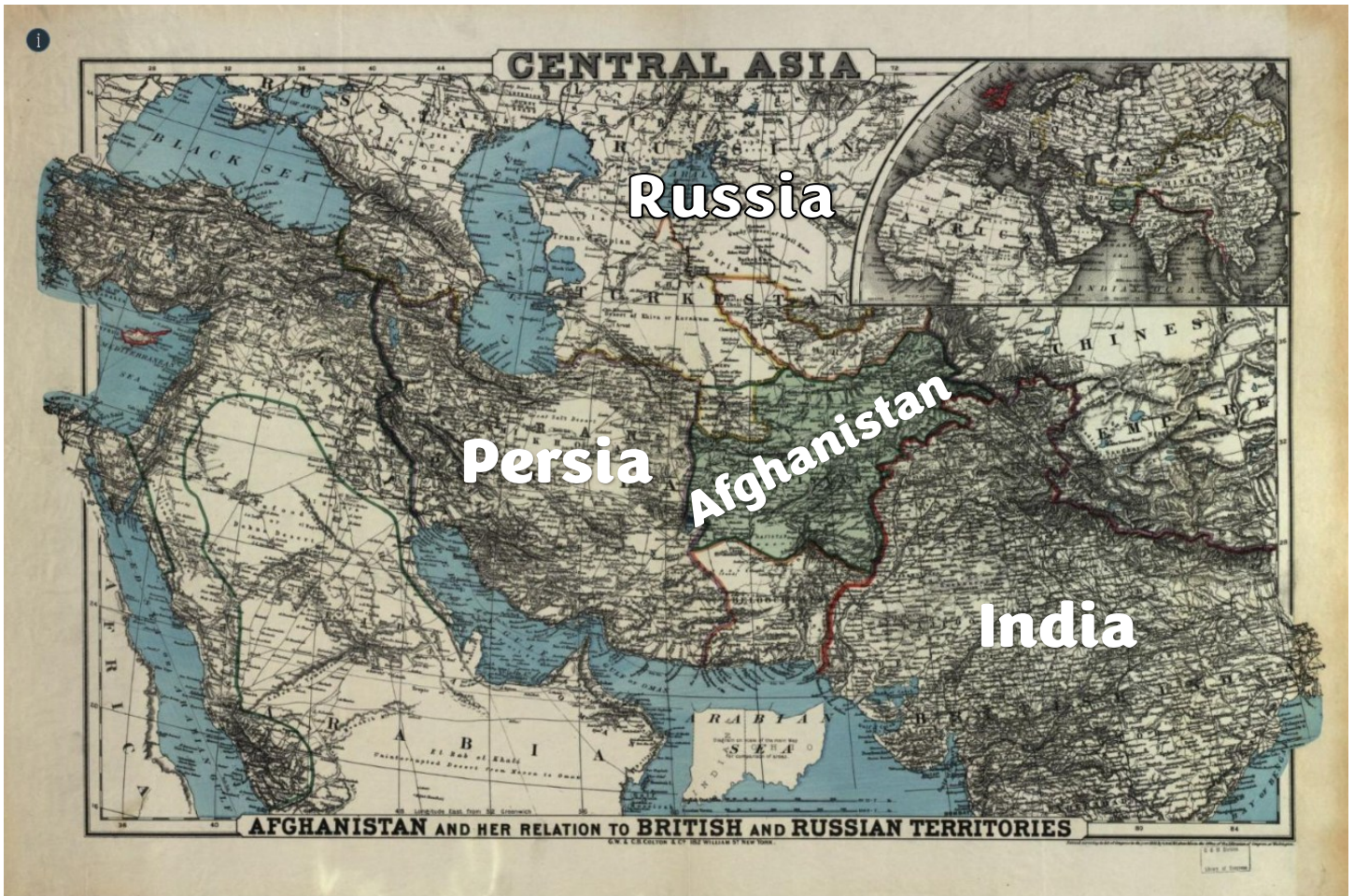
This map, published in 1885, shows Afghanistan's relation to British and Russian territories.

The Great Game was a 19th-century geopolitical and diplomatic confrontation between the British Empire and the Russian Empire for supremacy in Central Asia.