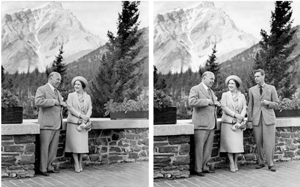
Prime minister Mackenzie King developed a strong attachment to Queen Elizabeth (consort to King George VI). Some of his personal pictures were altered to reflect his attachment.