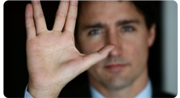
In a tweet, Canadian Prime Minister Justin Trudeau marked the death of Leonard Nimoy ("Spock" from the original Star Trek Series) in 2015.