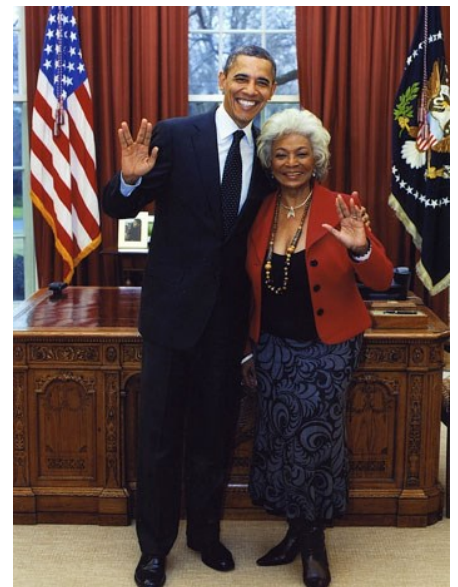
President Obama meets his hero, Star Trek's Nichelle Nichols, in 2012. Both give the Vulcan Salute at the White House.

Star Trek: The Motion Picture (1979) Star Trek II: The Wrath of Khan (1982) Star Trek III: The Search for Spock (1984) Star Trek IV: The Voyage Home (1986) Star Trek V: The Final Frontier (1989) Star Trek VI: The Undiscovered Country (1991)* Star Trek: Generations (1994) Star Trek: First Contact (1996) Star Trek: Insurrection (1998) Star Trek: Nemesis (2002) Star Trek (2009) Star Trek into Darkness (2013) Star Trek Beyond (2016)