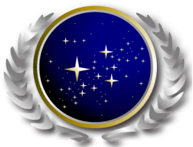
United Federation of Planets (Circa 2290)