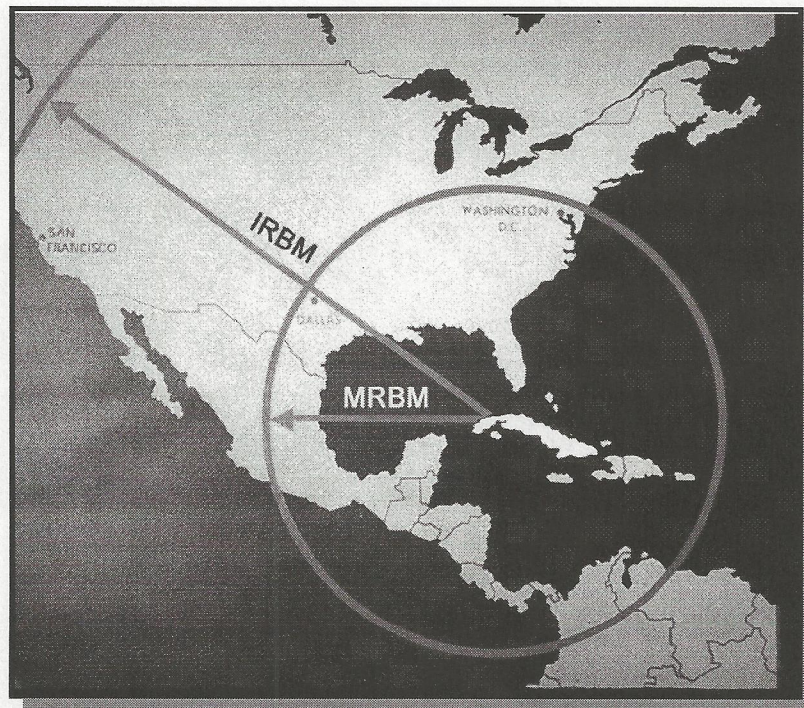
Range of missiles stationed in Cuba