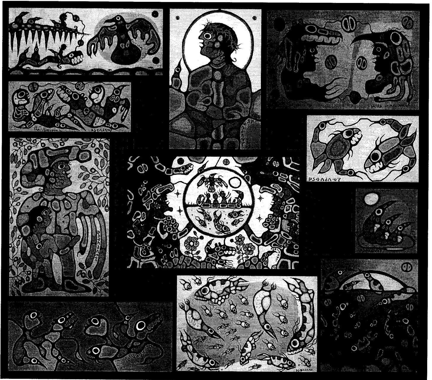
Works by Aboriginal Canadian artist Norval Morrisseau