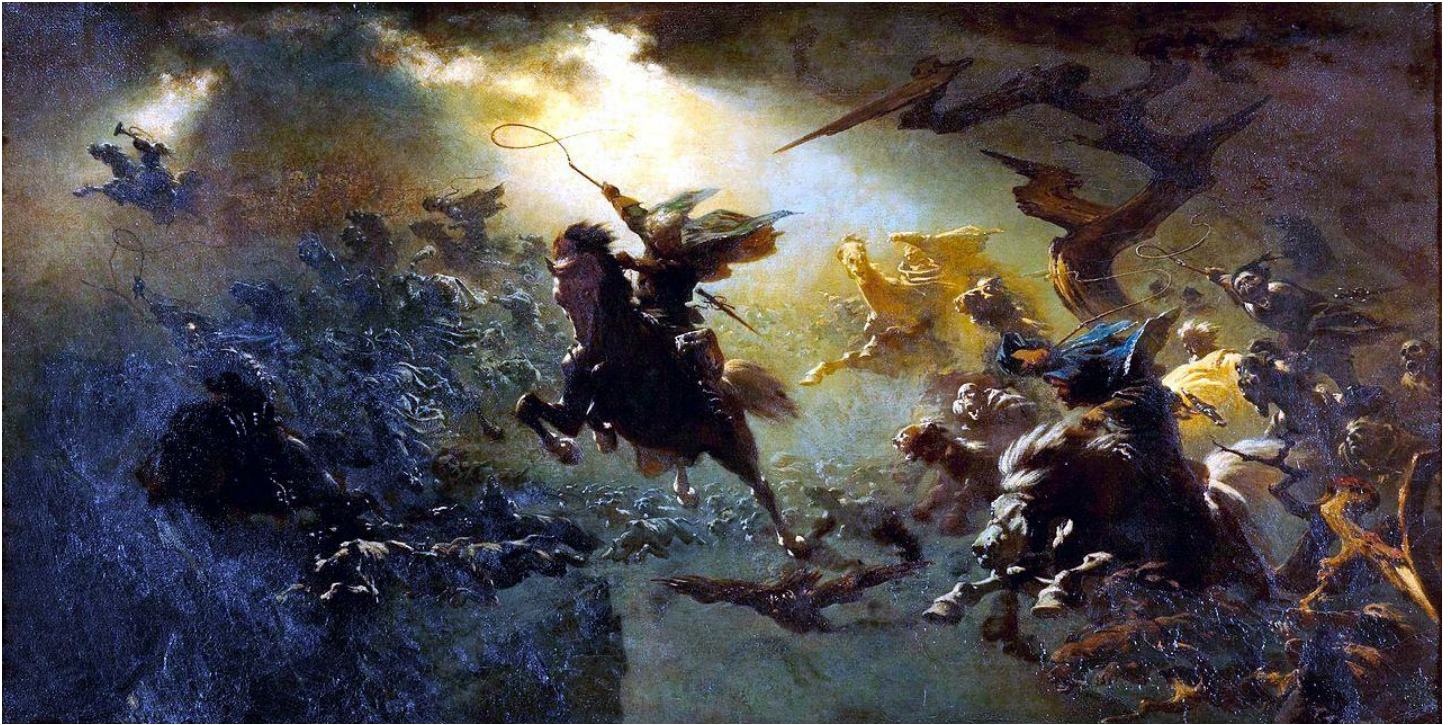
The Wild Hunt