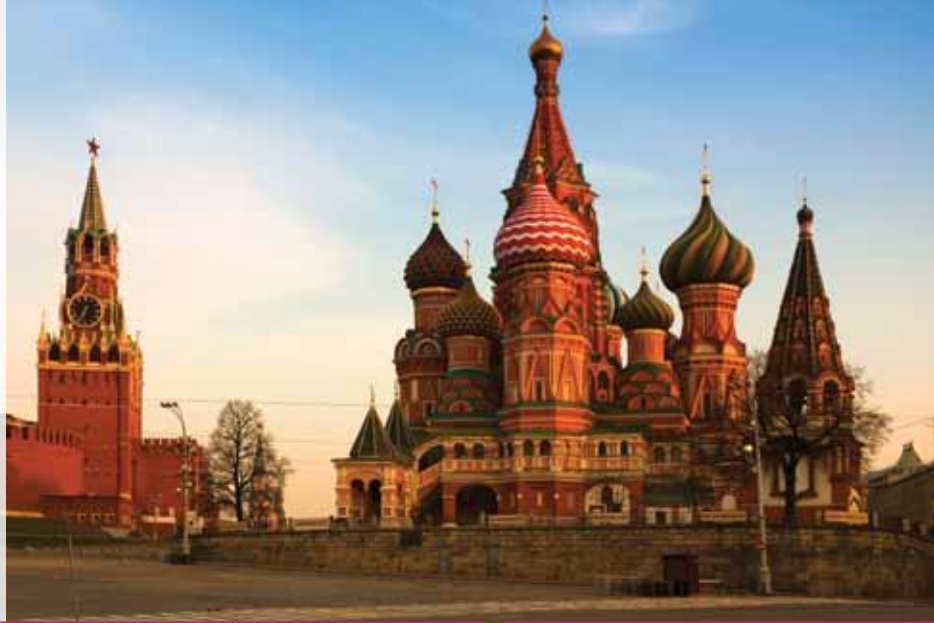
St. Basil's Cathedral Moscow, Russia

Begin your visit to Moscow in iconic Red Square, large enough to accommodate more than two million people. Marvel at the colorful cupolas of St. Basil's Cathedral. According to legend, Ivan the Terrible took drastic measures to ensure that the architect would never build anything more beautiful. Visit the Kremlin, which once contained all of Moscow inside its 15th-century walls. Walk across the czarist Square of Cathedrals. Each cathedral had a particular purpose: one for marrying, one for burying and a third for coronations. End your tour at the Armory Palace, the oldest and most richly furnished museum of the Kremlin. Exhibits include gold and silver jewelry from the past millennium, Russian armor and the breathtakingly ornate Fabergé eggs.