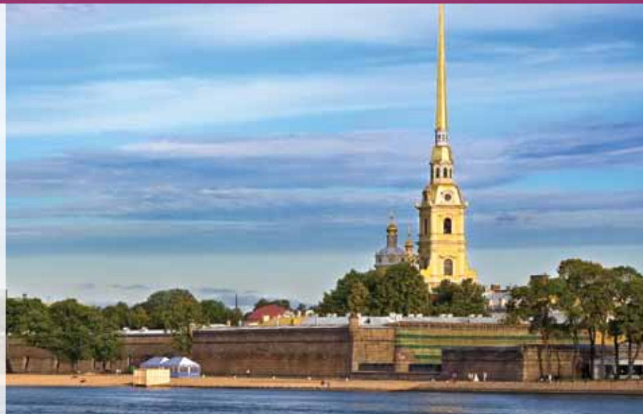
The Peter and Paul Fortress St. Petersburg, Russia

Welcome to St. Petersburg, once the capital of the Russian empire. Visit the Winter Palace, once the residence of Catherine the Great and site of the overthrow of the Russian monarchy in 1917. The Winter Palace now is part of the vast Hermitage Museum, where you can see the czars' spectacular art collection. You'll also visit the Peter and Paul Fortress—Trotsky, Gorky and Dostoyevsky were all imprisoned here. Finally, discover Russia's cultural heritage at the St. Petersburg Museum of History. A focus of the museum is the time Russians refer to as the Blockade, the 900 days of bombing and starvation between September 1941 and January 1944 when German forces surrounded Leningrad.