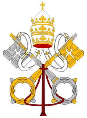
Arms of Vatican City