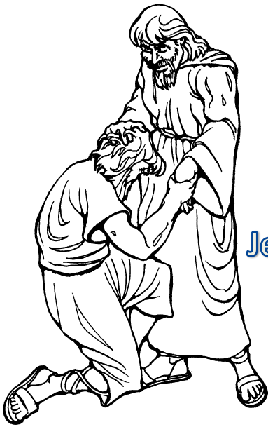
Jesus and Peter (the first pope)