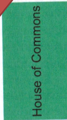
House of Commons