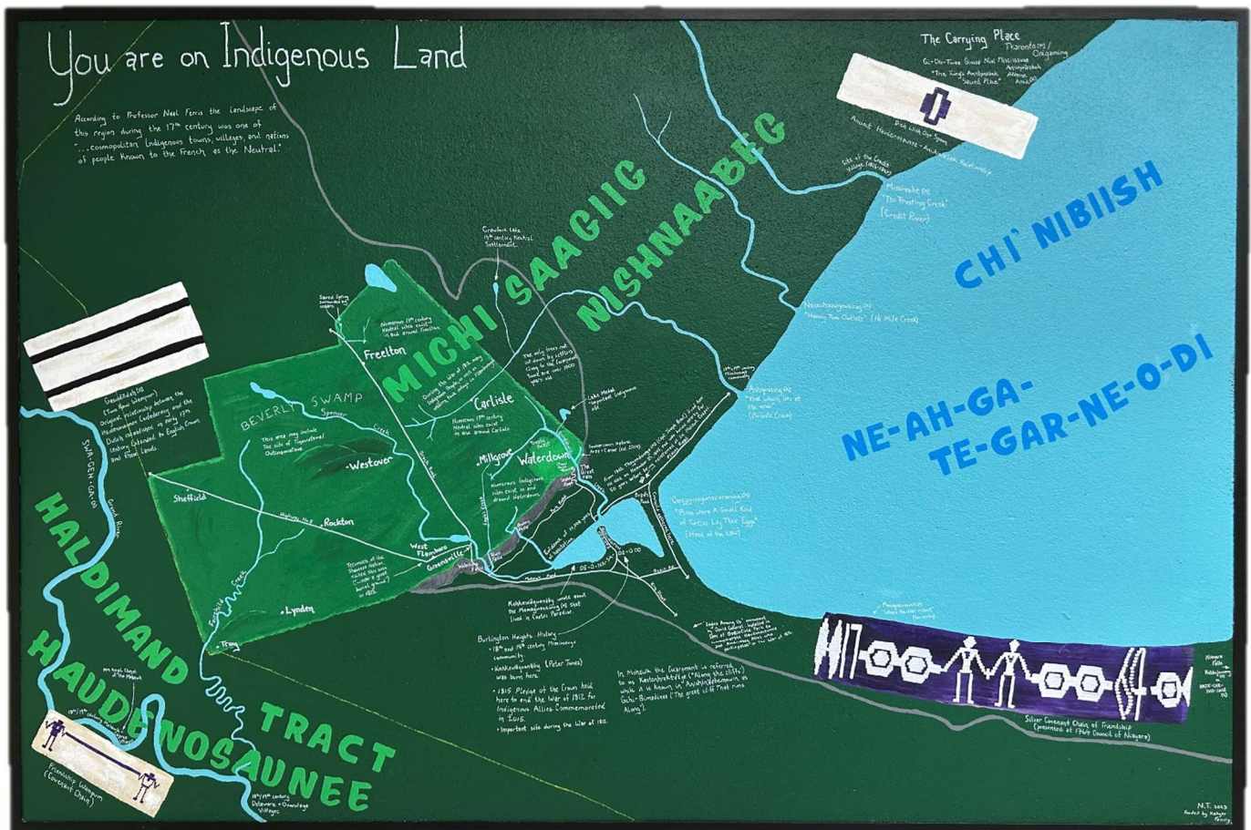
New WDHS mural exploring the Indigenous identity of this region.