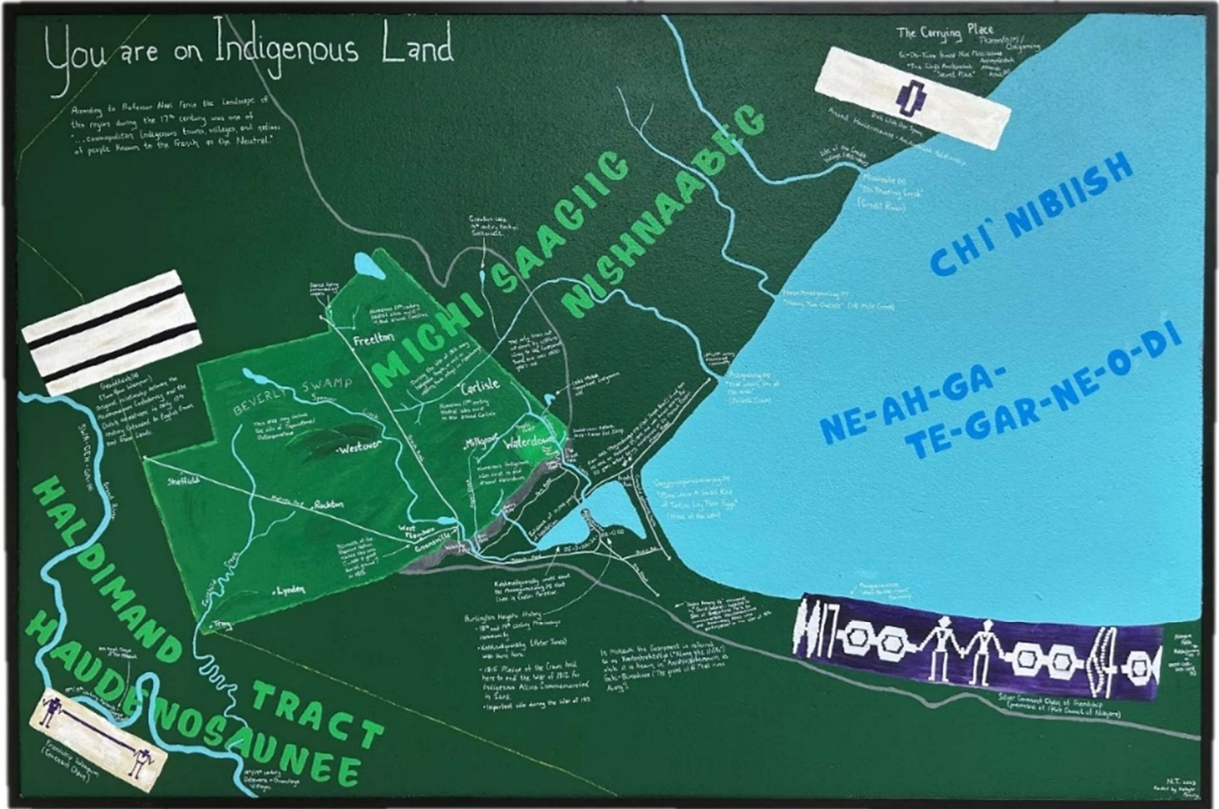
WDHS mural exploring the Indigenous history and identity of this region. The mural can be found on the first floor (near the Auto Shop). Click on it to learn more.