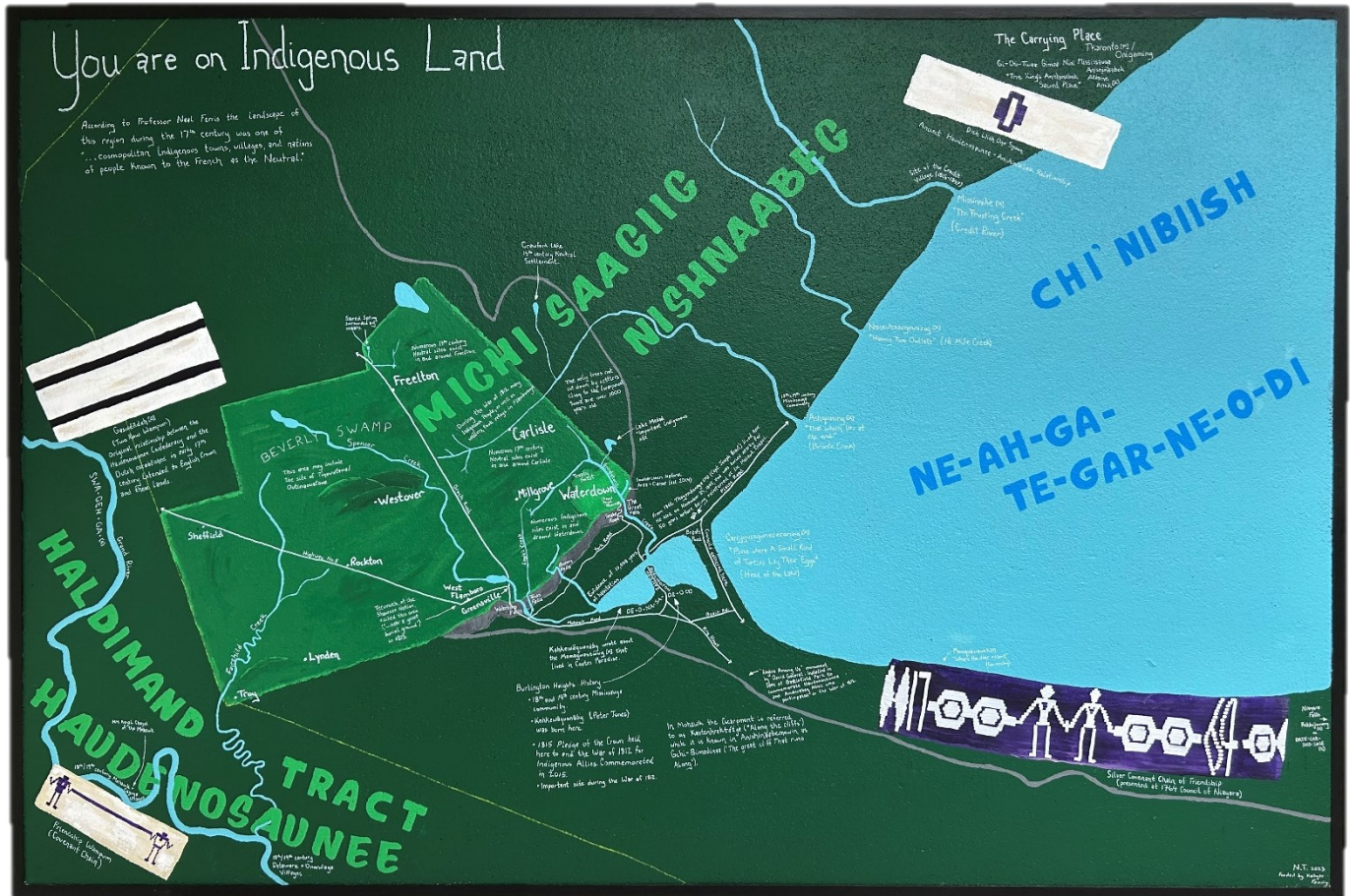
New WDHS mural exploring the Indigenous identity of this region.

(Learn more about the above mural using the QR Code on the left)