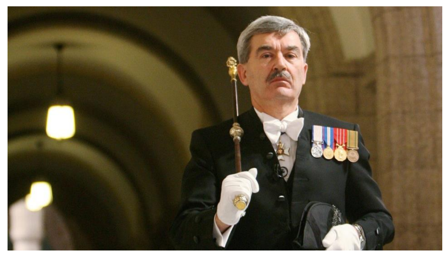
Canada's Usher of the Black Rod can trace back his office to the reign of King Henry VIII. His ceremonial act of knocking on the door of the House of Commons recalls King Charles I's attempt to arrest five MPs in 1642.

The Irish uprising of October 1641 raised tensions between the King and Parliament over the command of the Army. Parliament issued a Grand Remonstrance repeating their grievances, impeached 12 bishops and attempted to impeach The Queen.