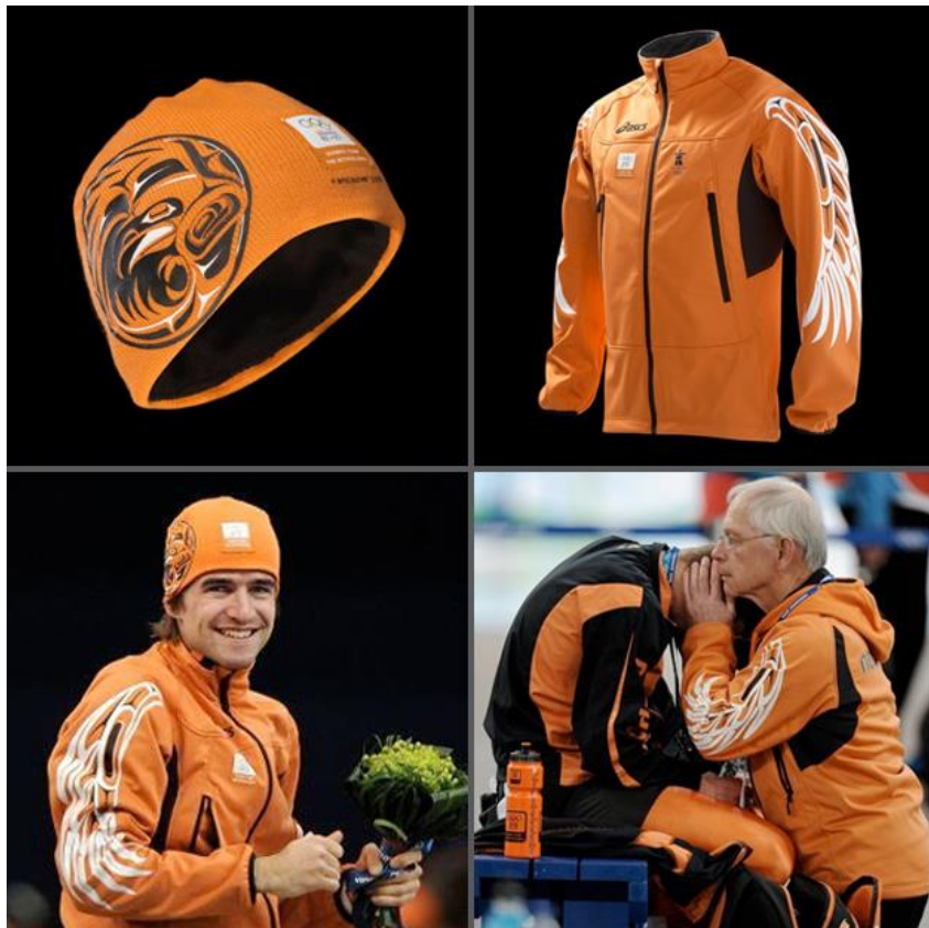
Dutch Olympic Uniforms (2010)