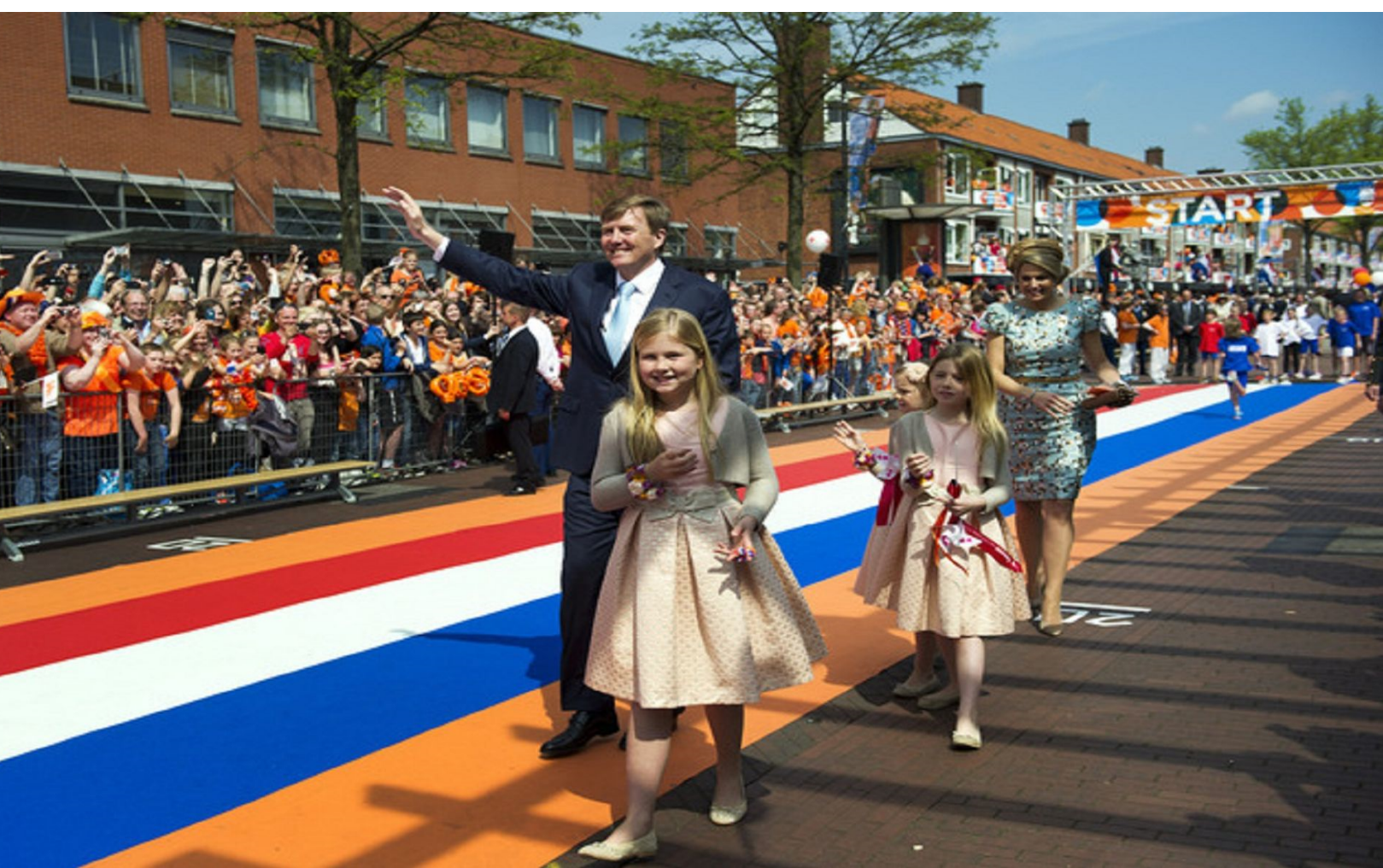
Current monarch of the Netherlands: King Willem-Alexander and his wife Queen Máxima on “King’s Day” (2019)