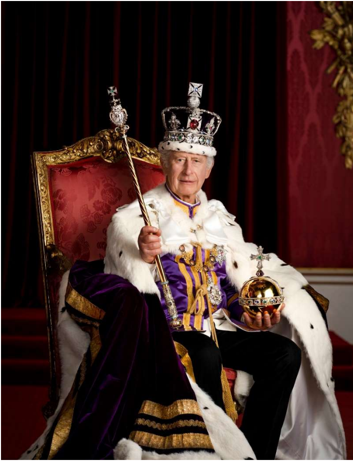
His Majesty King Charles III "in State," or manifesting the "body politic."

The State, with rights and powers existing in law, that is immortal.