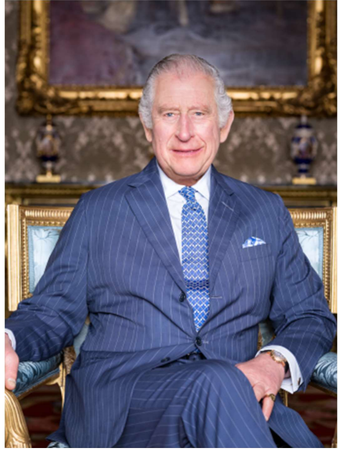
Charles Windsor-Mountbatten "in his personal capacity," or his "body natural."

The State, with rights and powers existing in law, that is immortal.