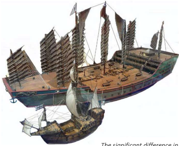
The significant difference in size between the Chinese vessels and their European contemporaries.