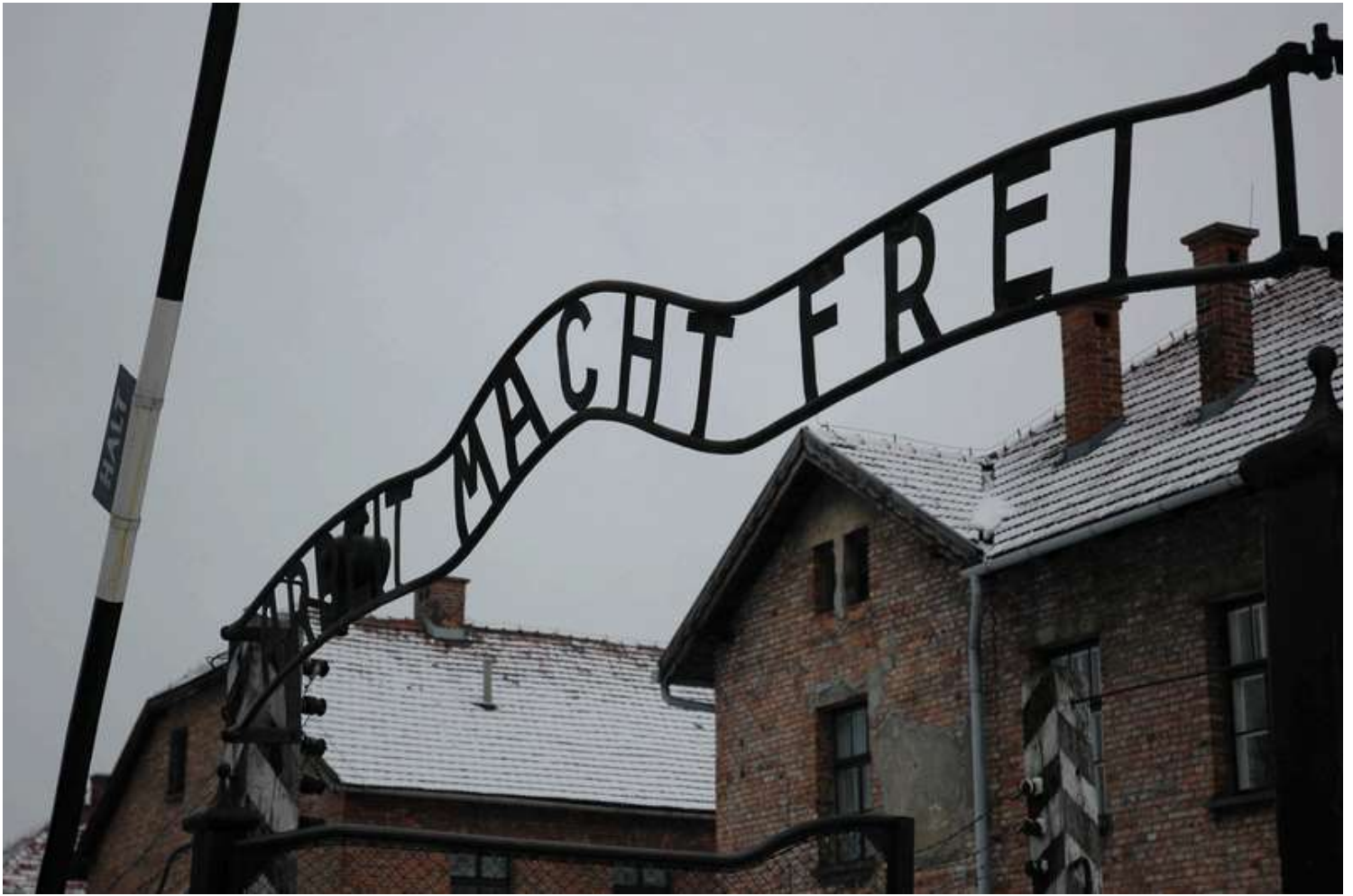
The sign over the main gate to the Auschwitz concentration camp.