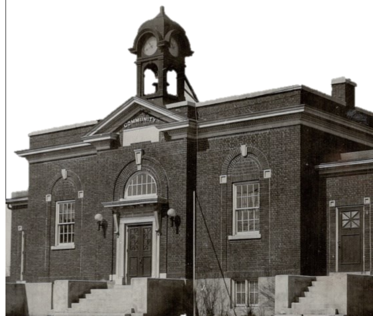
Memorial Hall, 1920 (page 127-128)