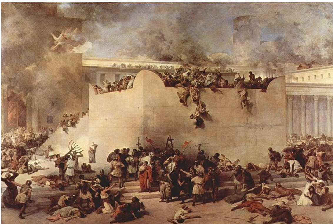
The destruction of the Temple of Jerusalem, Francesco Hayez