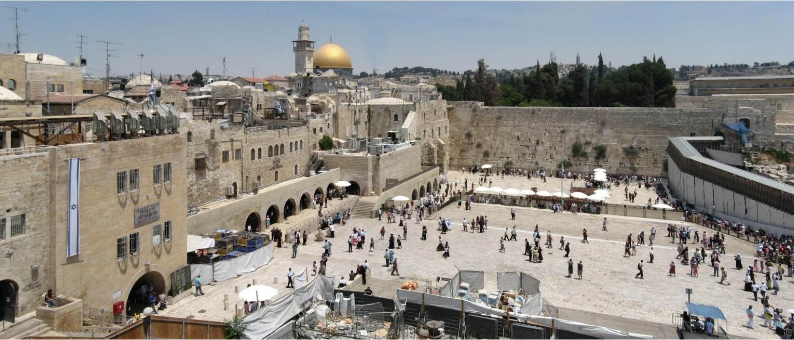
The Wailing Wall is located in the Old City of Jerusalem at the foot of the western side of the Temple Mount. It is a remnant of the ancient wall that surrounded the Jewish Temple's courtyard, and is arguably the most sacred site recognized by the Jewish faith outside of the Temple Mount itself.