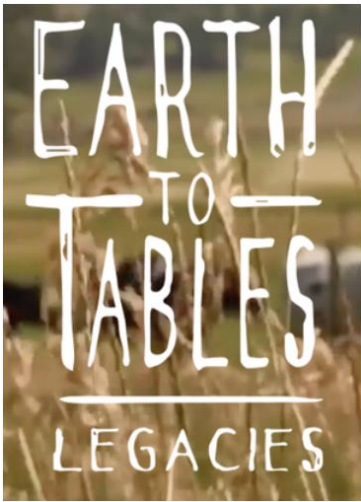
Click on the image to visit website

The Earth to Tables Legacies Project explores a number of important teachings related to our food, including land, language and sovereignty. Students are recommended explore this site, starting with the video " A Story of a Project. "