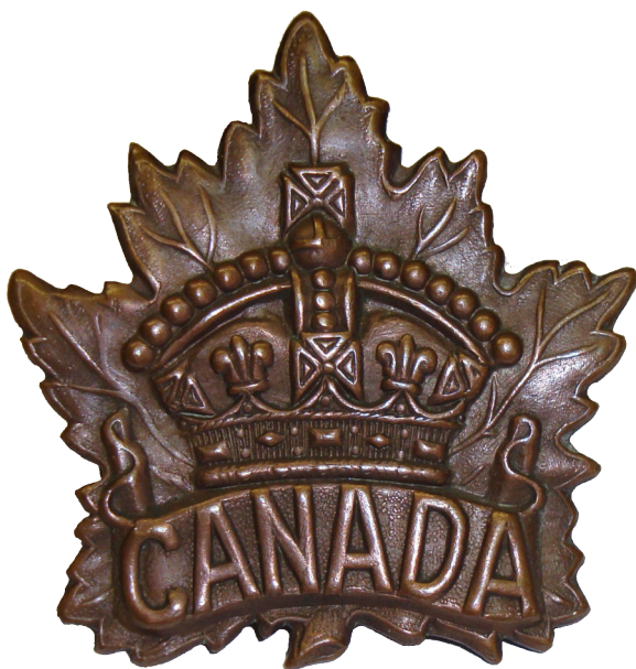
The badge of the Canadian Expeditionary Force sent to Europe during the outbreak of the First World War

Only the province of Nova Scotia has a distinct flag at the start of the 20 th century. . .