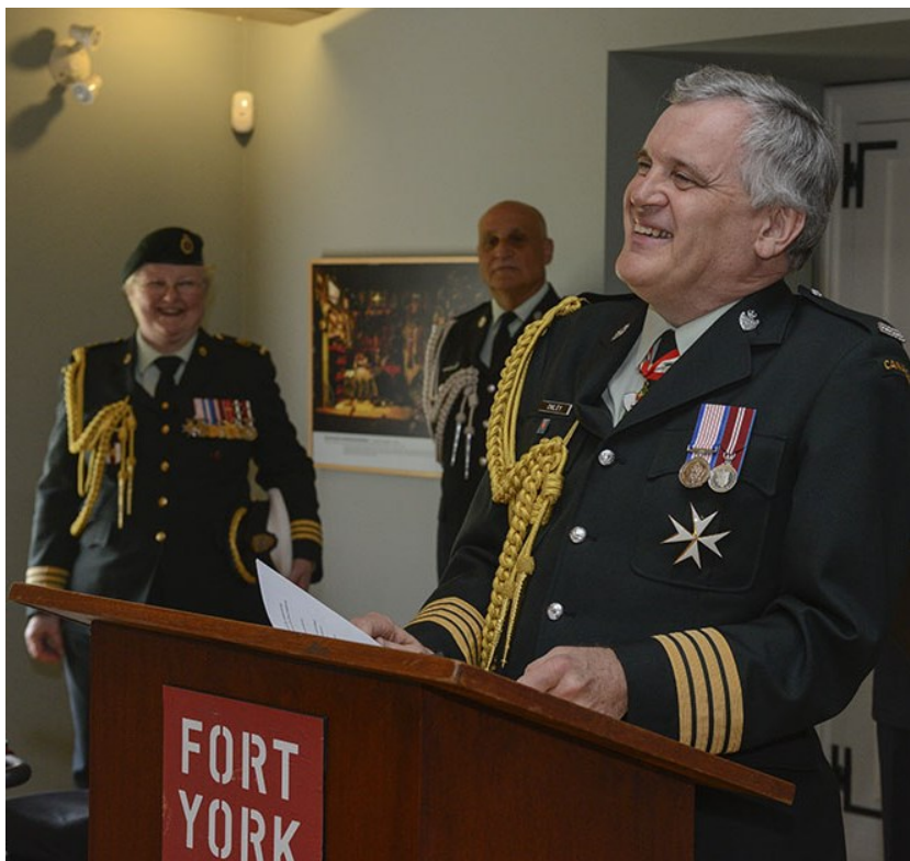
The Honourable David C. Onley, OOnt, Lieutenant Governor of Ontario Honorary Captain of the WDHS Boys' Rugby Club

Check out our website at www.tidridge.com (click on the Waterdown Boys' Rugby Club heading)