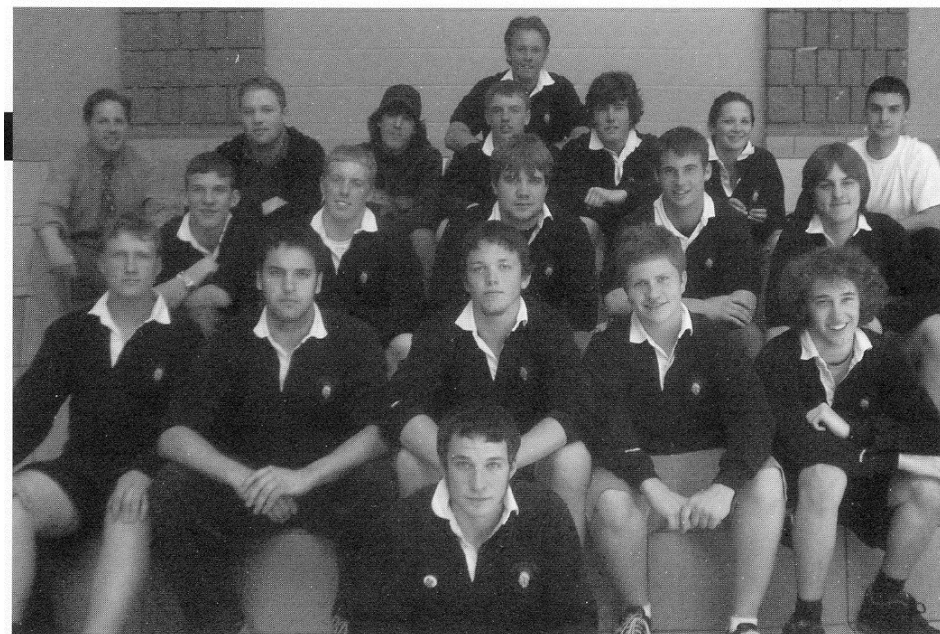
The Originals, 2005