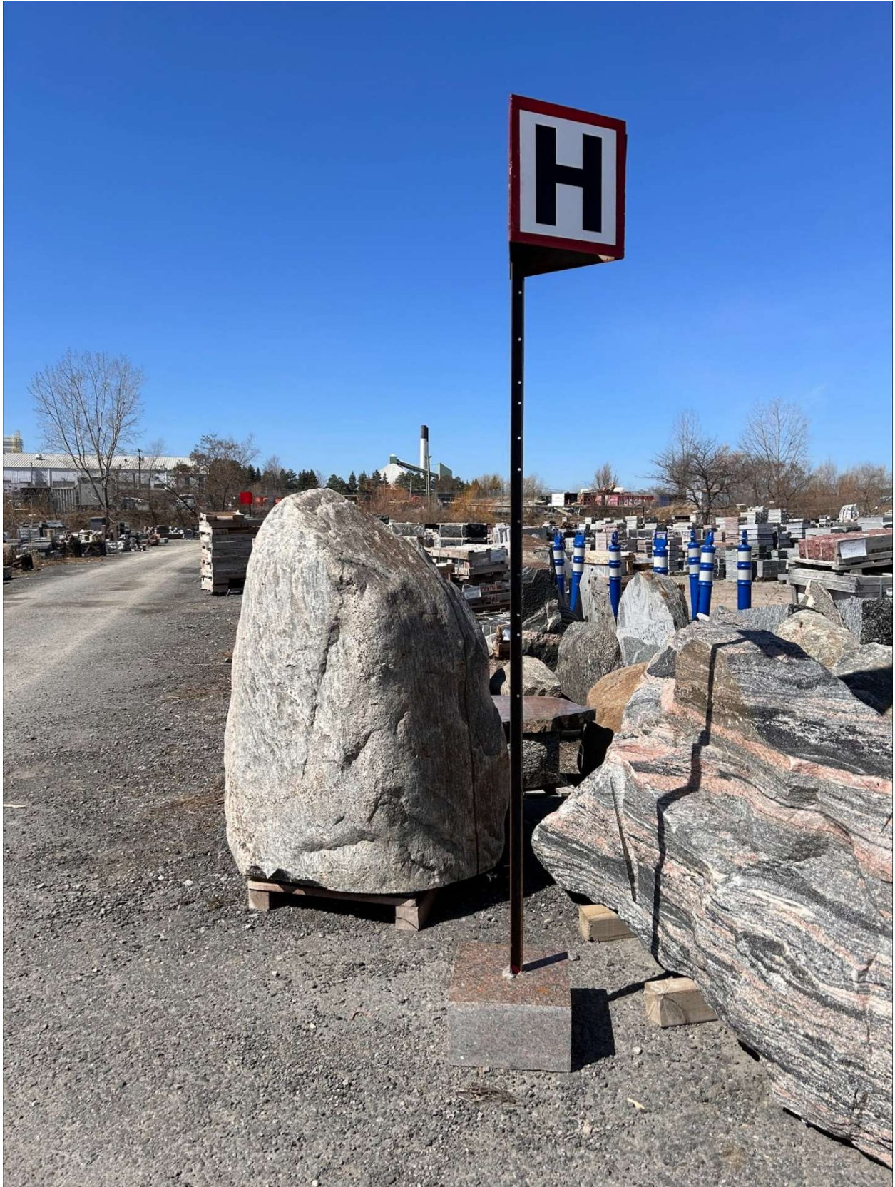
Figure 2. Stone selected for "Indigenous Treaty Partners." Stands 4-4/2 feet tall.