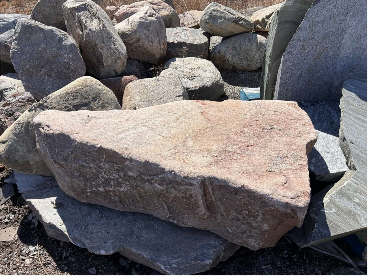
Figure 1. Stone selected for "The Crown." Stands 4-4/2 feet tall.