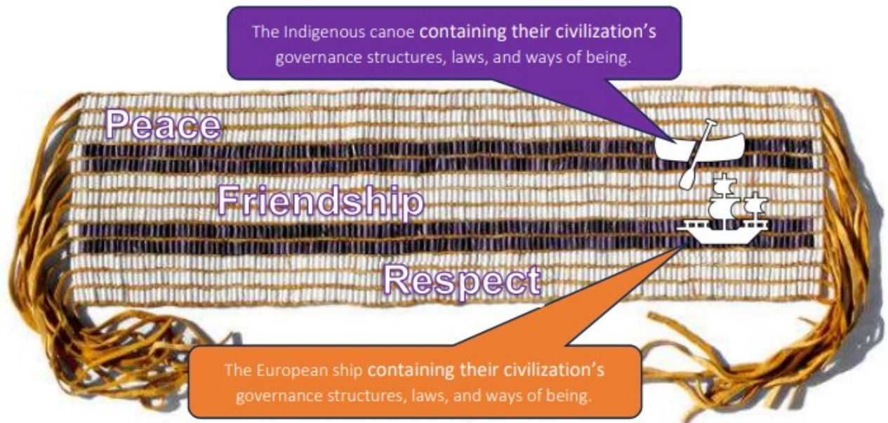
The Teioháte Kaswenta (Mohawk), Tekani Teyothata'tye Kaswénta (Cayuga), or Two Row Wampum, dates from the 17 th century and is often used to illustrate the relationship established by the Tehontatenentsonteronhtáhkwa (Covenant Chain).